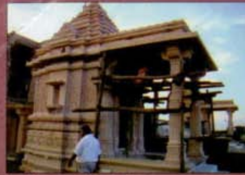
New Shwetambar Jain Temple

Shwetambar Jain Temples - A beautiful Shwetambar Jain Temple is presently under construction near the old Shwetambar Temple. The entire temple structure, being made with buff sandstone, is going to be a unique architectural delight with thousand of images from the Jain Pantheon on display.