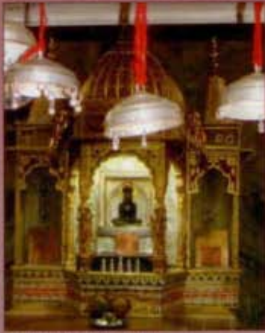
'Tikhaf wale Baba ki Vedi'

consisting different types of medicated herbs. Many idols, Stupas & Stambhs of the periods of Kushan & Guptas have been discovered, proving Ahicchatra's importance during these periods.