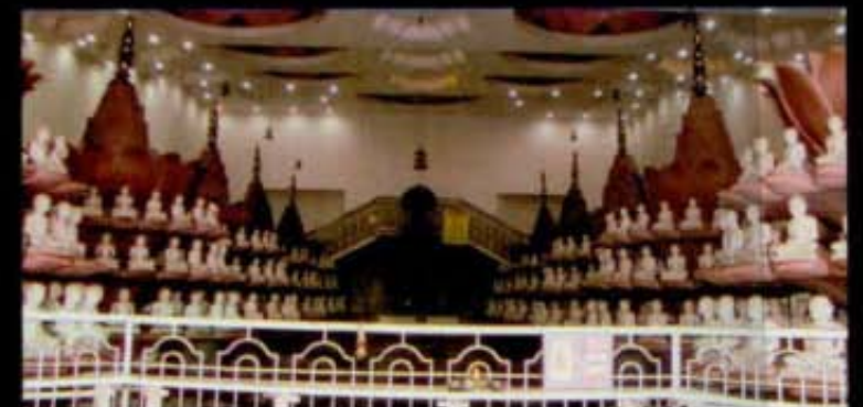
Tis Chaubisi Temple