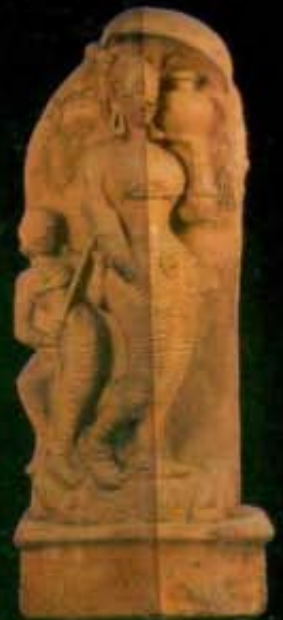
Terracotta image of Ganga found from Ahicchatra Excavations, 5th Century, National Museum, New Delhi

Beyond the period of Bhagwan Parshvanath, being the capitol state of Nag Rajas this was a famous Jain state. During his Vihar, Bhagwan Parshvanath had visited this place. He used to meditate in the forests of Ahicchatra, during which Meghmali or Kamatasur created an incessant shower of rains inundating the entire area, in order to disturb his meditation. Parshvanath got immersed in water up to his neck. To protect him, Nagraja accompanied by his queens, appeared holding a canopy of his thousand hoods over Lord Parshvanath's head and coiled himself around his body. This led to the place being called as Ahicchatra.