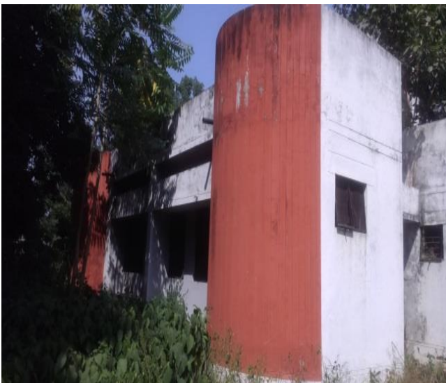
View of Building