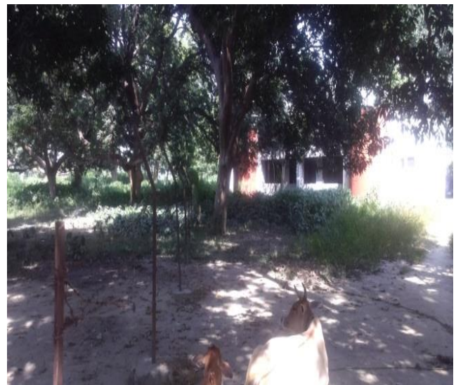
Back yard of Building