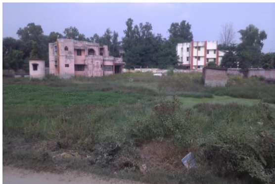
Vacant Land in the property