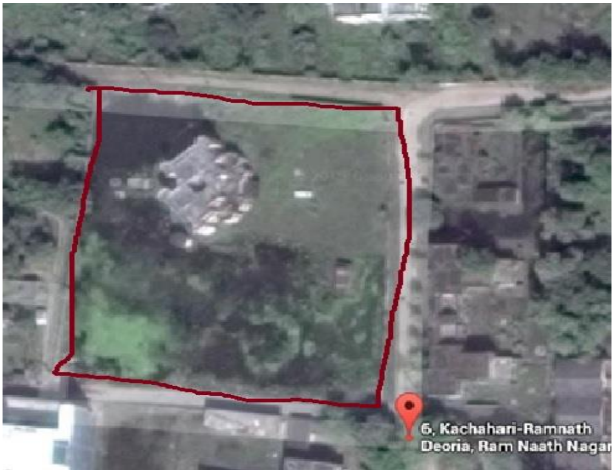
Figure: Project Site

The property is spread over a plot of 6,750 sq. mts. (1.66 acres) with a built -up area of 477 sq. mts. (5134.38 sq. ft.). Rahi Tourist Bungalow, Deoriya is a G+1 structure with 4 rooms. The building has reception, restauration, hall and kitchen. The property has large open space.