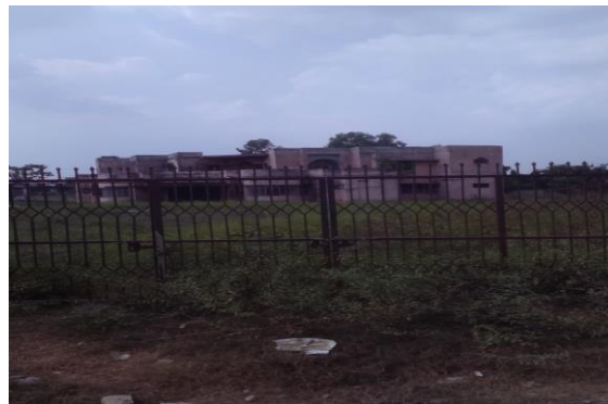
Front view of the property

The area of the project site available for development is detailed below: