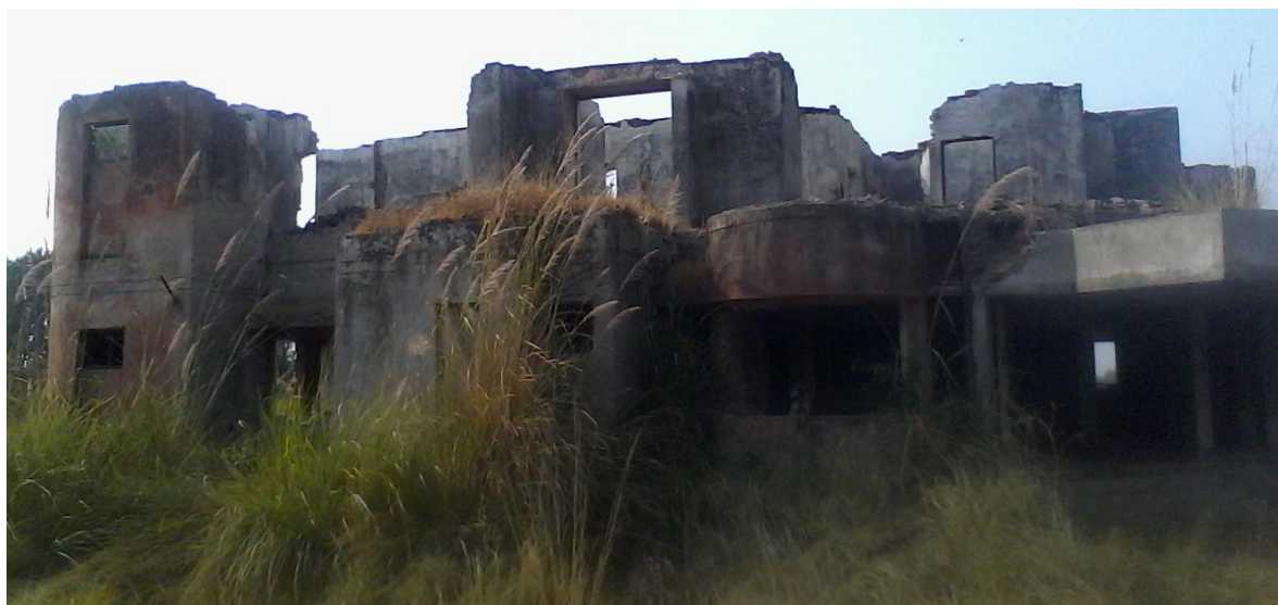
Exterior view of building