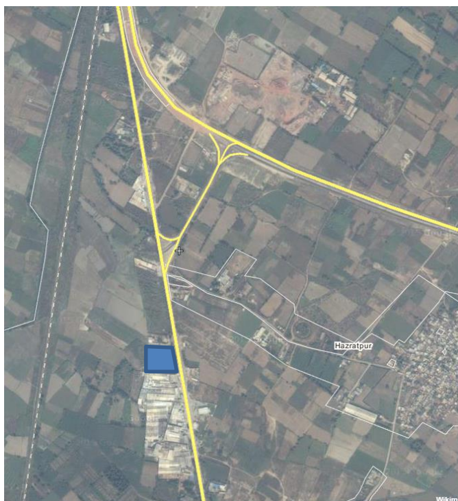
Location of site

Spread over 5,060 sqm plot area, RTB-K is a G+1 structure having a built-up area of around 369 sqm. However, only ground floor remains now, as first floor was demolished long back. As of now, the building has a reception lobby, restaurant, kitchen, hall, office and toilets on ground floor. The staircase is located in the centre of the building, forming the vertical core, around which all the other spaces have been planned. It is surrounded by reception on the front, restaurant on one side, kitchen at back and store-cum-office on the fourth side. The whole building is well lit naturally (during daytime).The property, however, needs renovation (existing) and additional construction for new facilities.