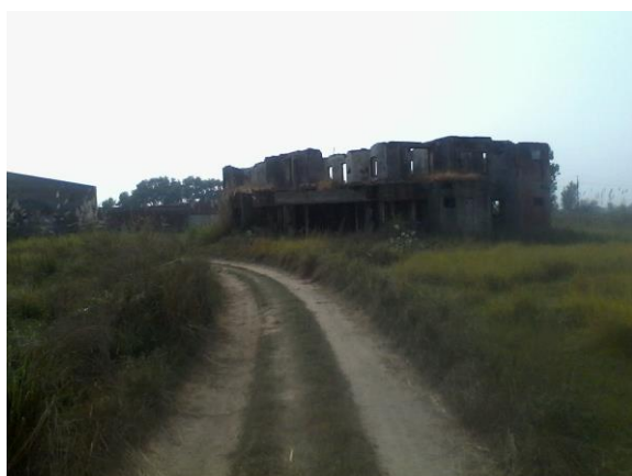
View of site