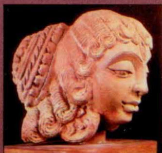
Head of Parvati, 5th Century A.D., Terracotta

Excavations at Ahicchatra started during the years 1940-44, under ASI. Painted Grey ware, associated with the advent of the Aryans in the Ganga Yamuna Valley, was recognized for the first time in the earliest levels of this site. It has also been one of the richest sites in India from the point of view of the total yield of terracottas. Fresh archaeological excavations at Ahicchatra have been carried out during the period 2007-08 and 2008-09 by the