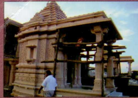
New Shwetambar Jain Temple

Shwetambar Jain Temples - A beautiful Shwetambar Jain Temple is presently under construction near the old Shwetambar Temple. The entire temple structure, being made with buff sandstone, is going to be a unique architectural delight with thousand of images from the Jain Pantheon on display.