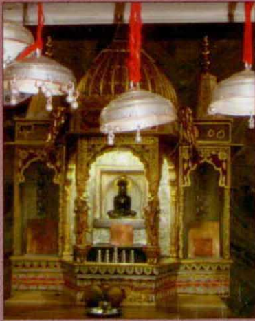
'Tikhwal wale Baba ki Vedi'

consisting different types of medicated herbs. Many idols, Stupas & Stambhs of the periods of Kushan & Guptas have been discovered, proving Ahicchatra's importance during these periods.