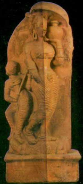
Terracotta Image of Ganga found from Ahicchatra Excavations, 5th Century, National Museum, New Delhi

Beyond the period of Bhagwan Parshvanath, being the capitol state of Nag Rajas this was a famous Jain state. During his Vihar, Bhagwan Parshvanath had visited this place. He used to meditate in the forests of Ahicchatra, during which Meghmali or Kamatasur created an incessant shower of rains inundating the entire area, in order to disturb his meditation. Parshvanath got immersed in water up to his neck. To protect him, Nagraja accompanied by his queens, appeared holding a canopy of his thousand hoods over Lord Parshvanath's head and coiled himself around his body. This led to the place being called as Ahicchatra.