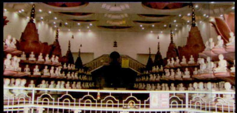
Tis Chaubisi Temple